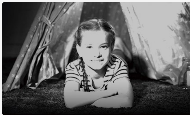
Without Smart IR

With Smart IR, the intensity of the infrared LEDs automatically adjusts to prevent overexposure in night vision mode, so you will get more details of the object or person captured at night.