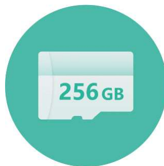
Supports MicroSD Card

*Cloud storage service is only available in certain markets. Please verify the availability before making any purchase.