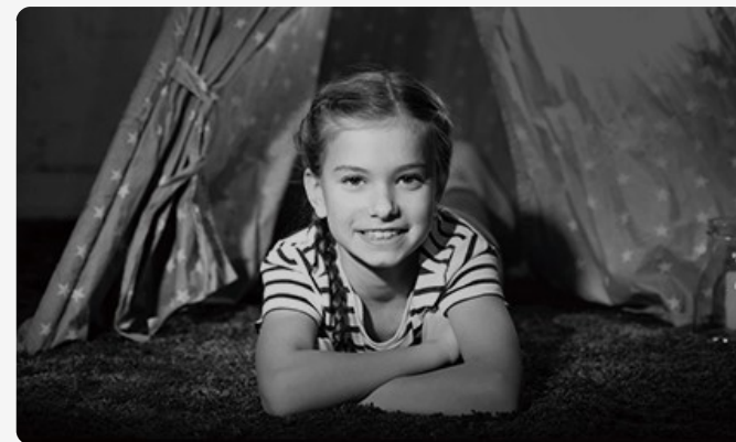
With Smart IR